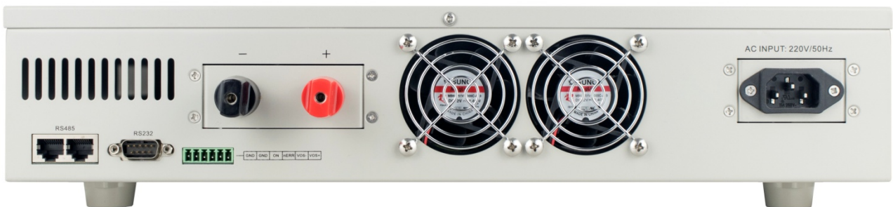
(220Vac input for 2.4kW~3kW)